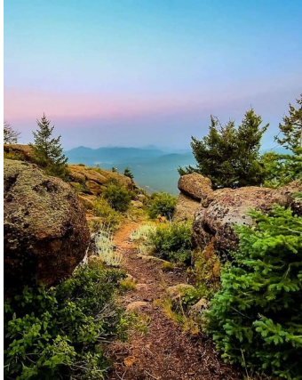
View from top of Lion's Head