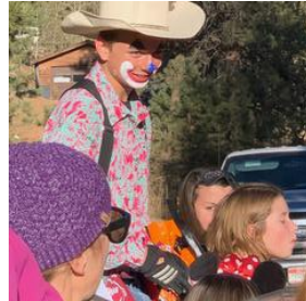
Photos from 2019 Halloween Parade